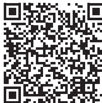
Scan here to access S.I. No. 79 of 2026